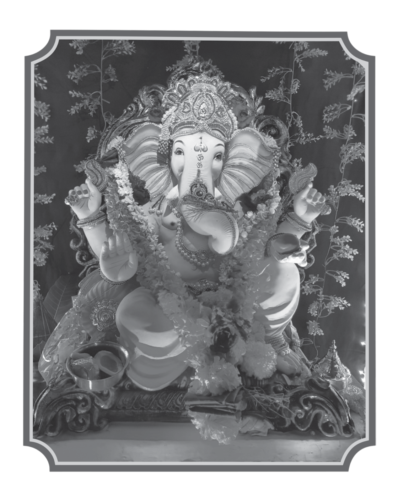
वक्रतुंड महाकाय सुर्यकोटिसमप्रभ निर्विछ्नं कुरु मे देव सर्वकार्येषु सर्वदा